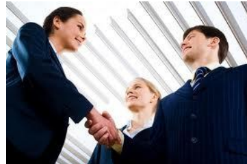
Operating License (**)