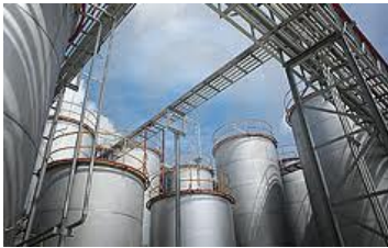
Safe Production License