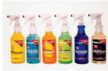
Safe Use License(*)