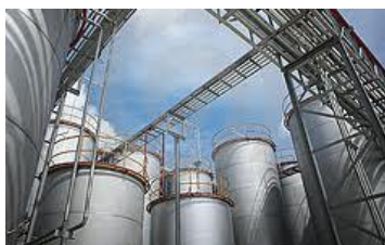
Production and Storage